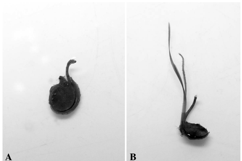
Fig. 1. – Photographs of Cymodocea nodosa seeds after hypo-salinity induction. A: seed showing the dorsal ridge opened, and the elongating cotyledon. B: seedling five weeks after the germination.

Data analysis: the t-test for independent samples was used to compare the cumulative percentages of germination of seeds collected in September 2008 and February 2009 in the two salinity treatments. The t-test for independent samples was also used to evaluate the difference for the number of leaves, the leaf surface area, the number of roots and the total root length of the seedlings between September 2008 and February 2009. Prior to the t-test analysis, the homogeneity of variances was tested by Levene's test. Because the seedling measurements were done at different intervals of time (the "full salinity" seedlings were measured exactly after 5 weeks of germination) while the "hypo-saline" seedlings were measured after 5 weeks of the initiation of the experiment, the early vegetative development